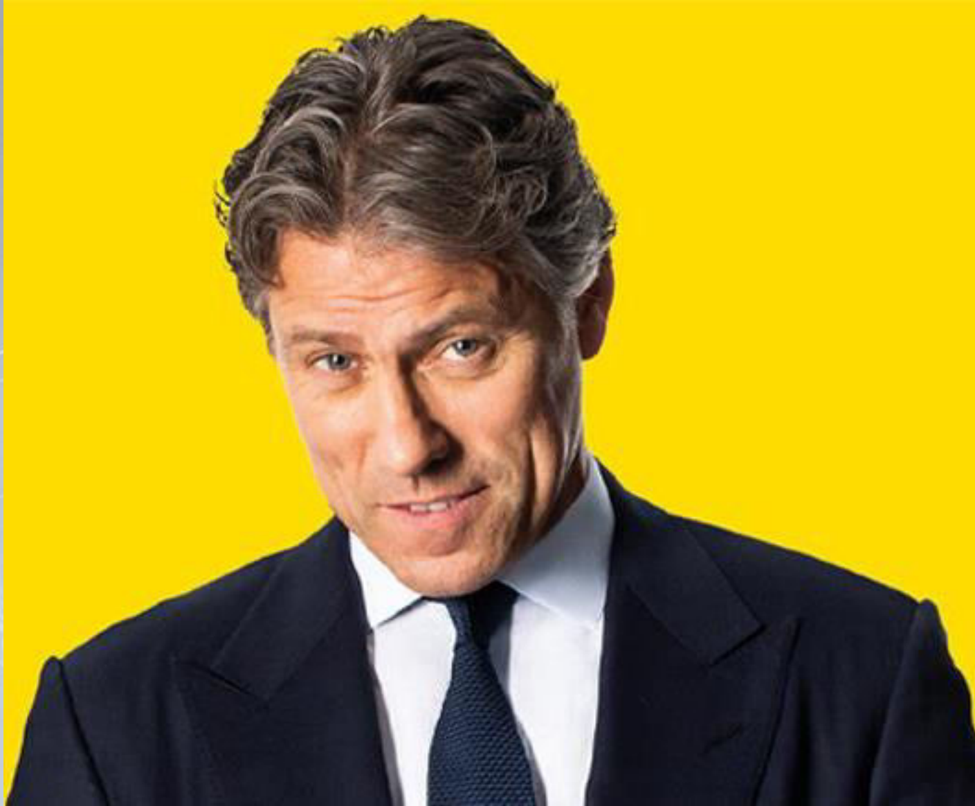
John Bishop - Love & Marriage